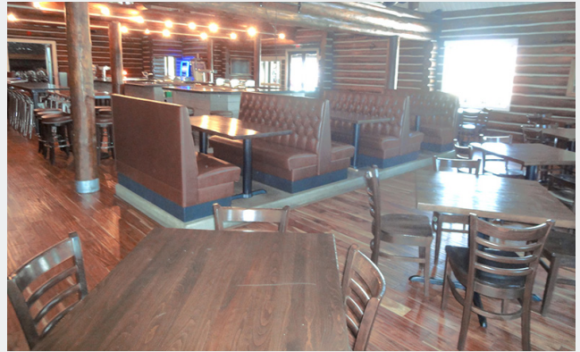
Main Seating Area