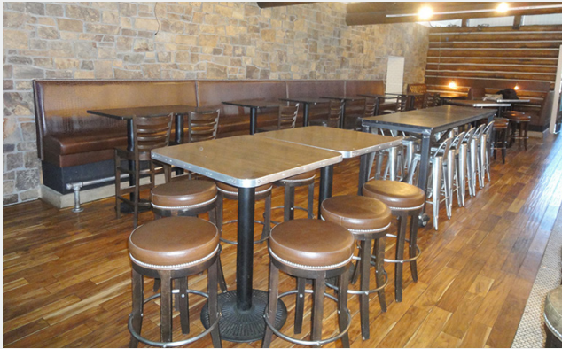
Side Seating Area