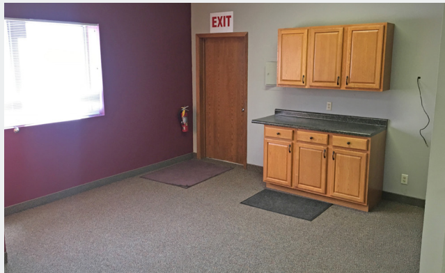
1,143 SF - Break Room