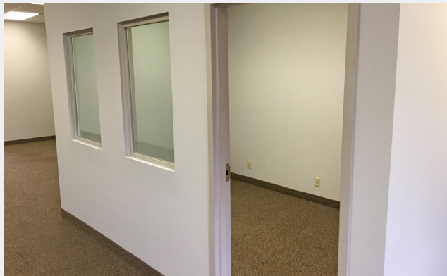
1,143 SF - Office