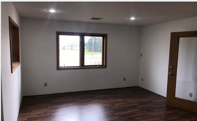
Front Office Area