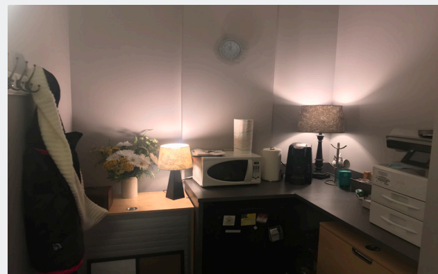
Kitchen / Copy Area