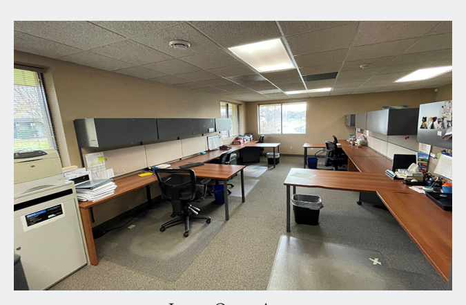
Large Open Area