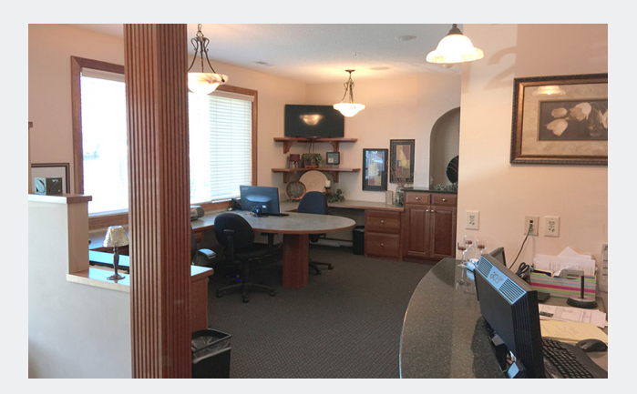
Front Work Stations