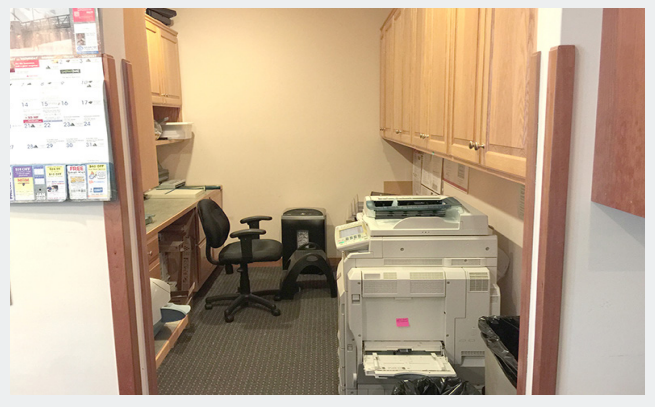
Copy / File Room