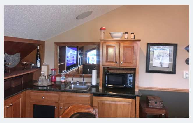
Upper Level Executive Kitchenette