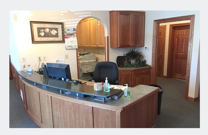
Reception Desk Area