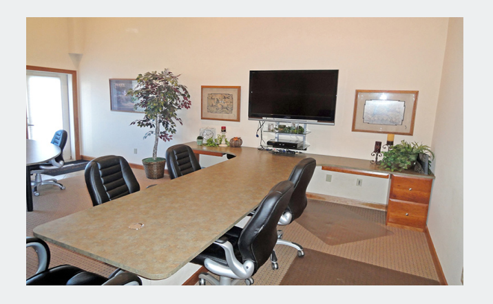
Open Back Area