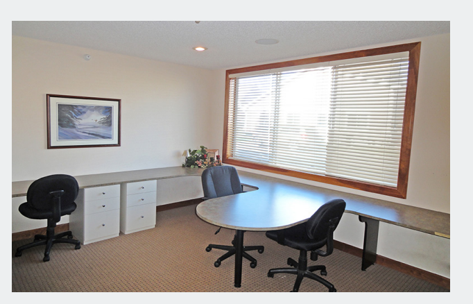
Back Office Area