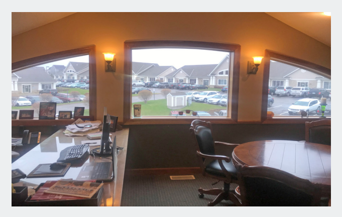
Upper Level Executive Office