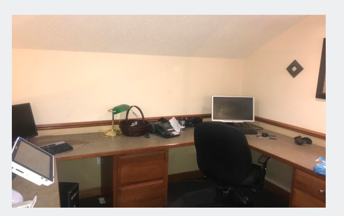
Upper Level Workstation