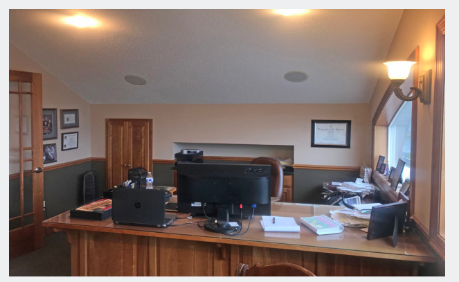
Upper Level Executive Office