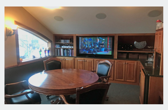
Upper Level Executive Office