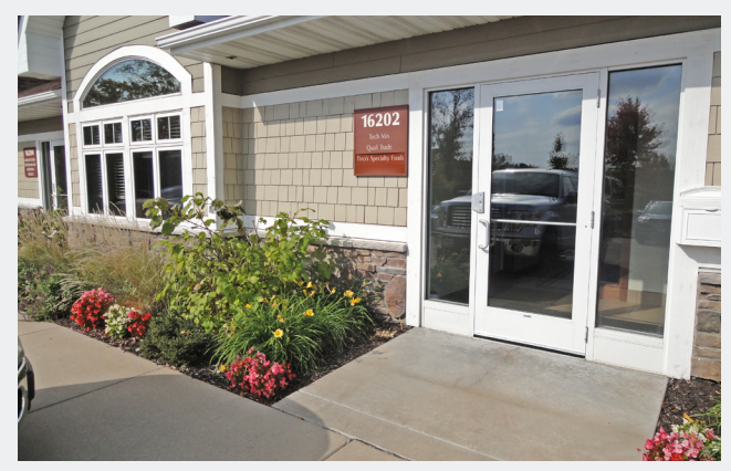
Private Front Entrance