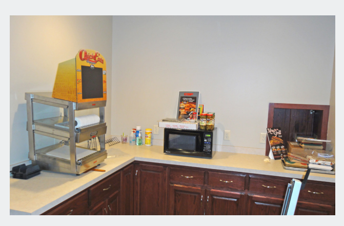
Work Room Area