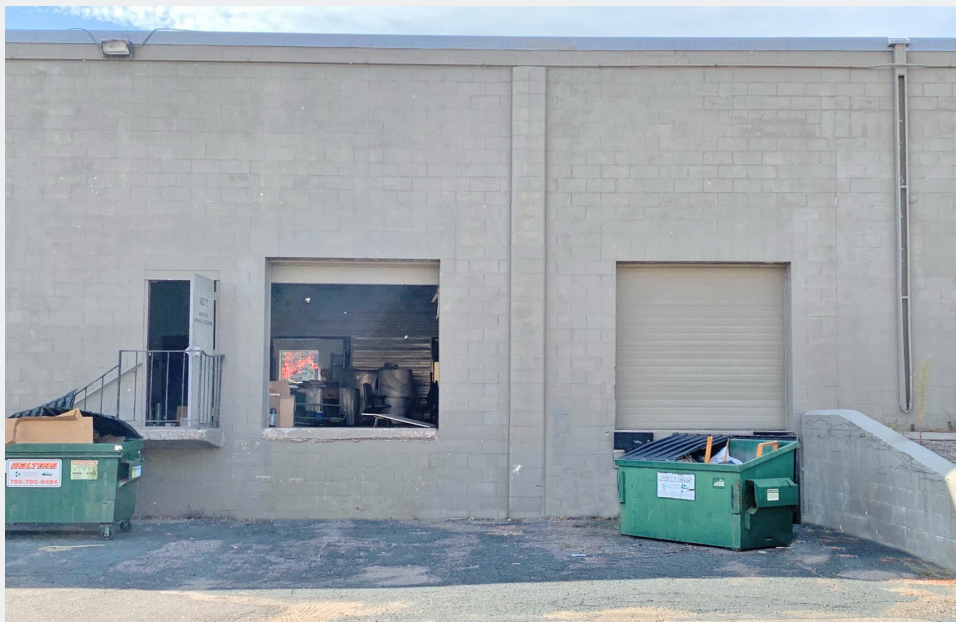
2 Dock Doors/ Back Entrance