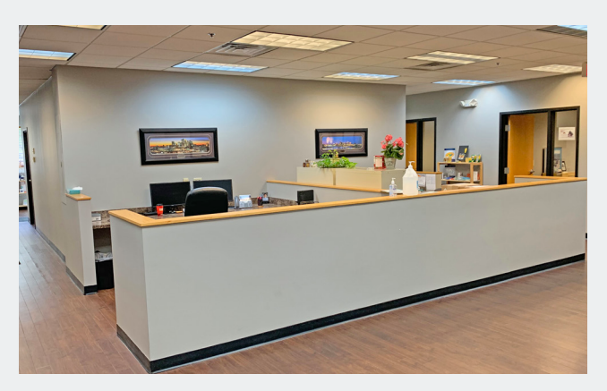
Reception Desk Area