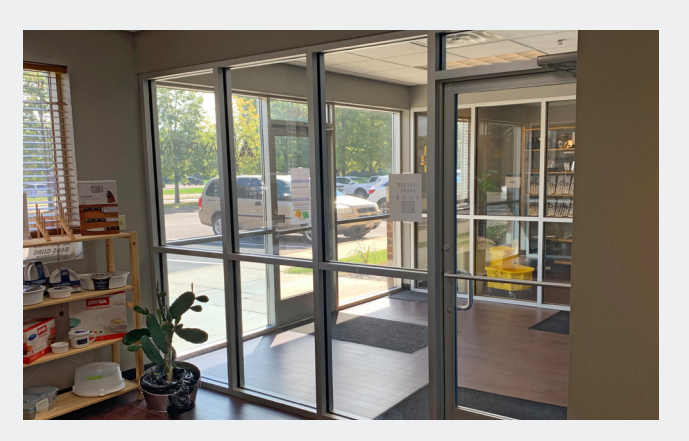
Front Entry View