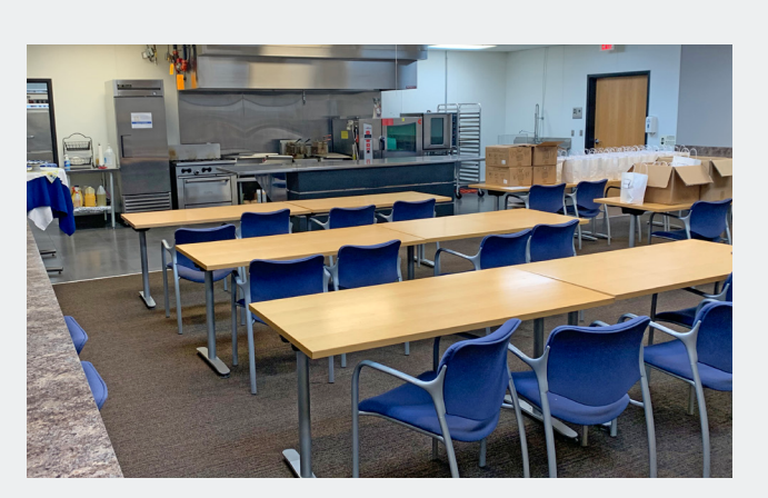
Kitchen / Classroom