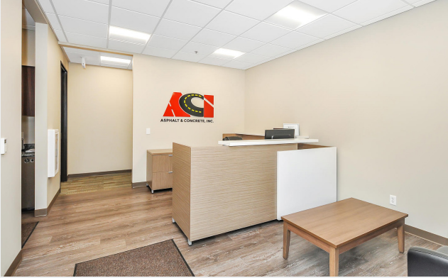
Front Lobby Area

FOR SUBLEASE 3,100 SF Office Space Available